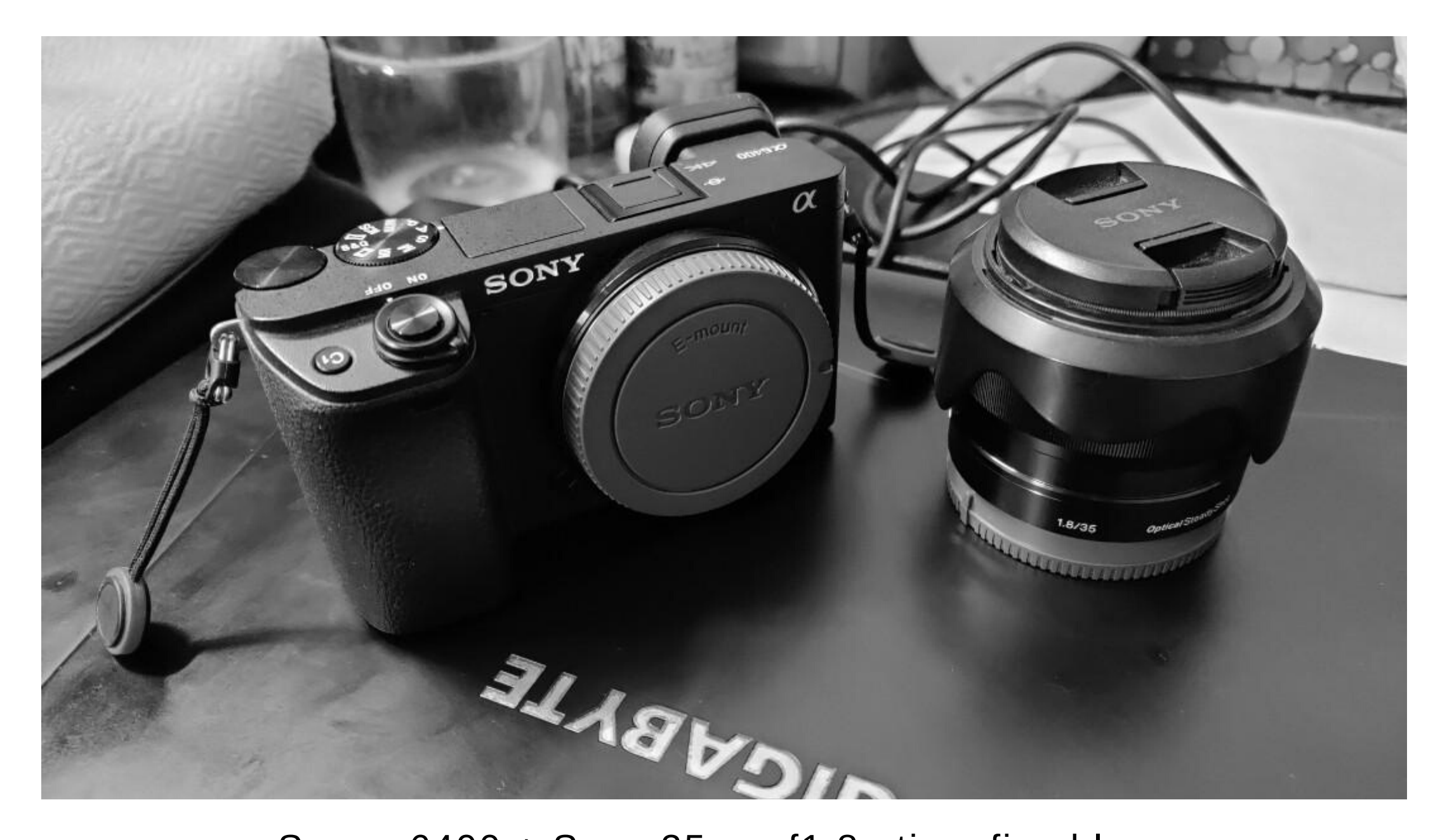
Sony a6400 + Sony 35mm f1.8 ptime fixed lens

If you choose to adopt this setup yourself for livestreaming, turn off the camera screen's display data, or else it'll pull through the converter and into your feed. Follow this tutorial, which was for a different model of Sony camera, but the steps were the same. When researching a tutorial for your own camera, look for how-tos on "clean HDMI."