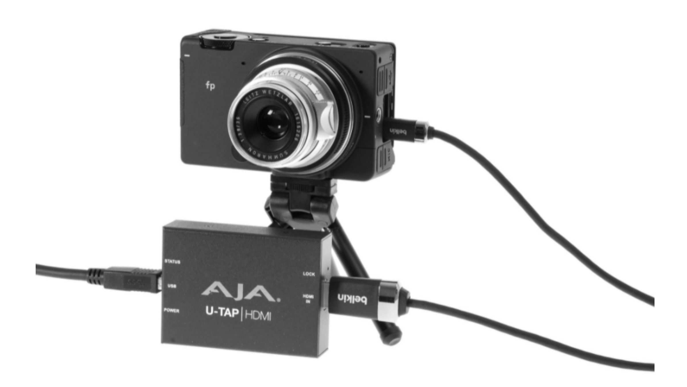
AJA U-TAP \ HDMI capture card connected to digital camera

There are plenty in the market with various price tags, but the most bank for your (higher end) buck is <u>AJA's U-Tap converter</u>. At close to $350, AJA is an investment but a small price to pay for beauty. Good news is there are others in the market like <u>Blackmagic</u> and <u>Elgato</u> providing more cost-effective solutions.