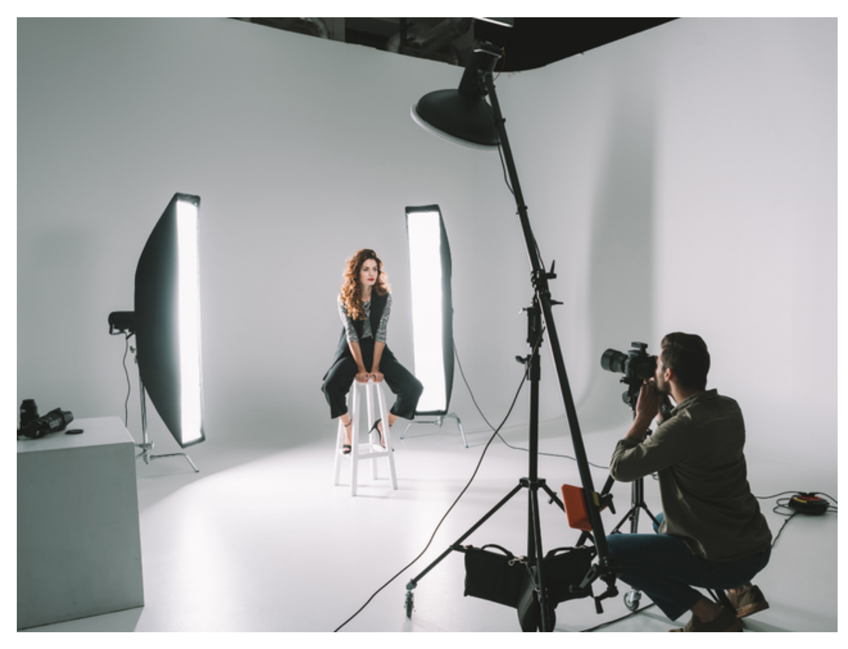
3-point light setup with central + two side lights For more lighting tips, check out this <u>article</u> from StudioBinder

Lighting is what makes or breaks your chance to captivate those on the other end of your Zoom call. Don't sell your visage short - let it shine consistently with solid lighting. Natural light is obviously ideal for a video setup, but can be unpredictable. Ring lights are a cheap alternative, but we aren't here for Instagram or TikTok likes. We are here to make power moves in the most beautiful way possible.